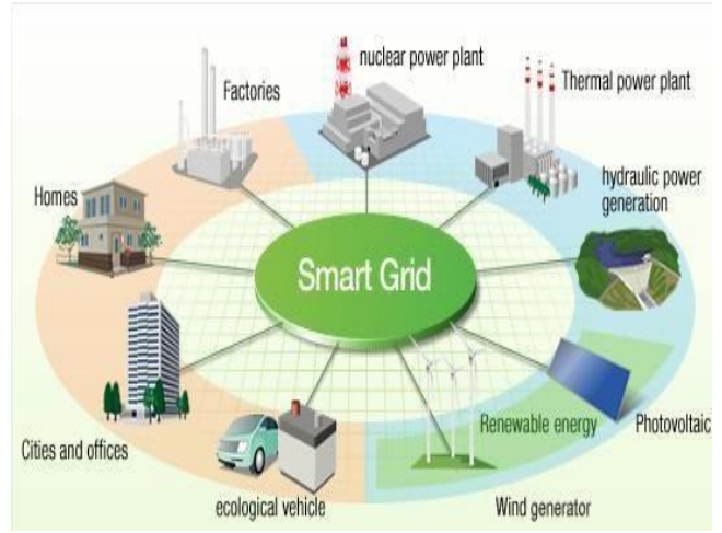
Figure 3: Areas affected by smart grid[5]

The smart grid is a very good way of improving energy efficiency. But the implementation of any new idea always